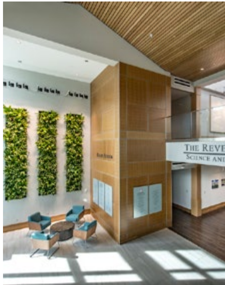
Living wall in lobby

Construction of the 34,000sf academic building took place over the course of 15 months, opening its doors to students in January 2020. Bowdoin's proactive use of building information modeling (BIM) throughout the project uncovered several coordination issues that were able to be mitigated prior to installing mechanical ductwork and piping in the field, which saved time and money.