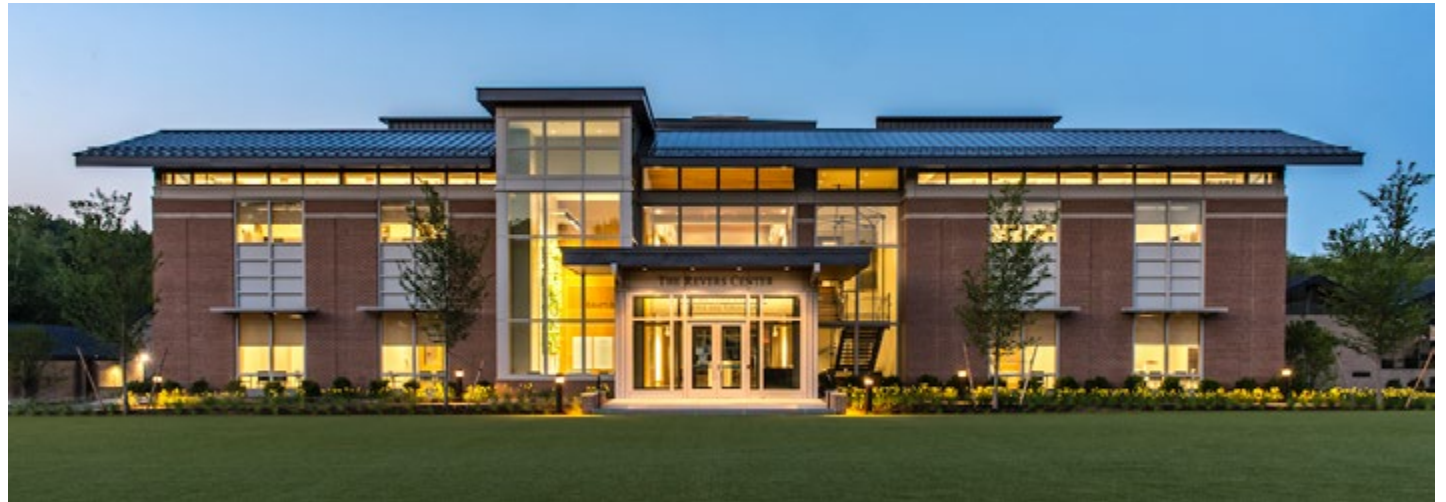
The Revers Center for Science and Visual Arts

A key feature of the project is the main entrance stair found in the front lobby. This was designed to hang from the ceiling off a single, 2-inch square rod. This building element was incorporated to tie in with the school's engineering program, demonstrating the important principals of physics, and highlights the overall educational purpose of the Revers Center.