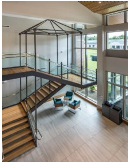
Pendulum staircase in lobby