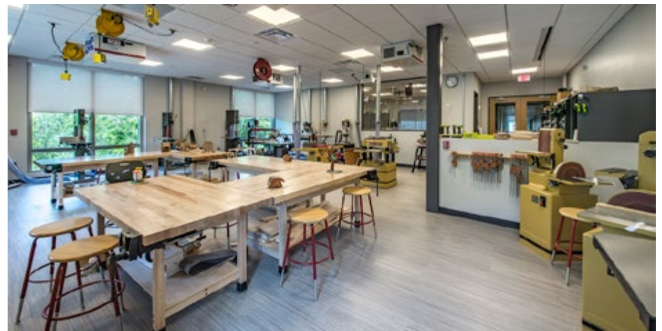
One of several art workshops